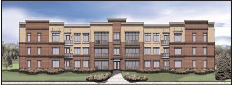
Rendering of Avalon at Inverness