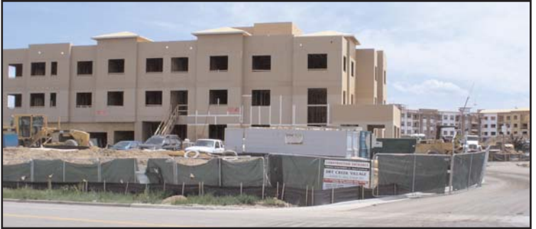
Fairfield at Dry Creek Village is currently under construction.

AMLI at Inverness , located at Dry Creek Road and Inverness Drive East, will offer exceptional apartment living with choices of designer finishes along with custom features in each unit.