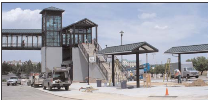
Pedestrian bridge at Inverness Drive West (under construction)

mizing their use of the new bridge, as well as answer any questions.