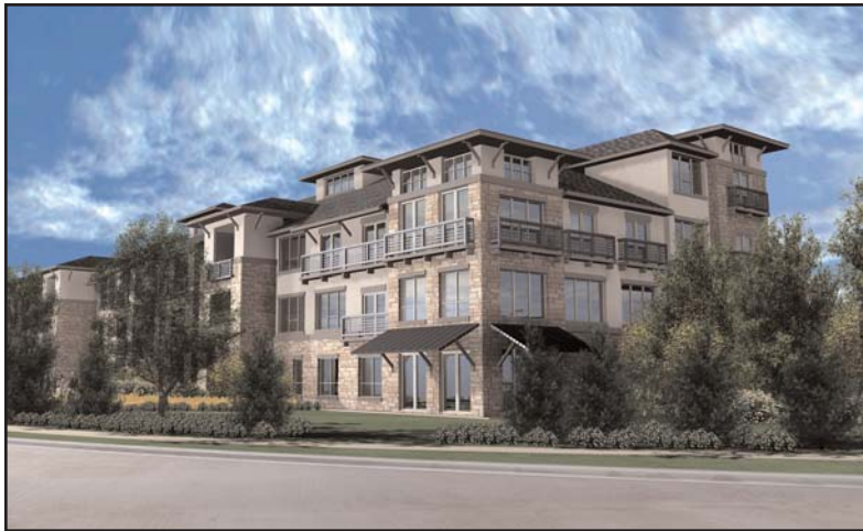
Rendering of AMLI at Inverness

AMLI has broken ground and expects to have the project completed by winter, 2008. Call 303-754-0200 for more information or email Inverness@amli.com .